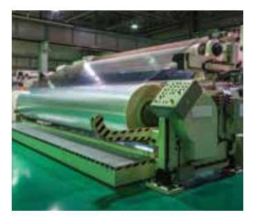
Cast-Oriented Film Winding Process